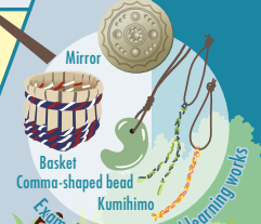
Examples of experiential learning works