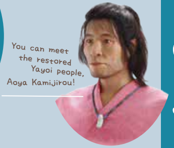
You can meet the restored Yayoi people, Aoya Kamijirou!

You can see, touch, and have fun learning about the Aoya Kamijichi site. You can also enjoy Yayoi experiences such as making magatama, kumihimo, and mirrors, as well as the museum shop.