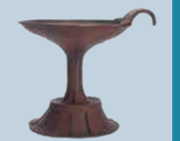
Restored Pedestaled Bowl

You can see, touch, and have fun learning about the Aoya Kamijichi site. You can also enjoy Yayoi experiences such as making magatama, kumihimo, and mirrors, as well as the museum shop.